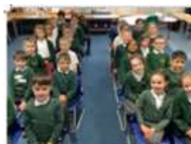
Traveling on the coach

This week, Year 2 used role-play, photographs on the board and a special script to imagine we were on a summer trip to the coast. We role played a coach ride, making sandcastles, exploring the sea wall and more. We spoke about the things we saw that are physical features in geography and human features in geography.